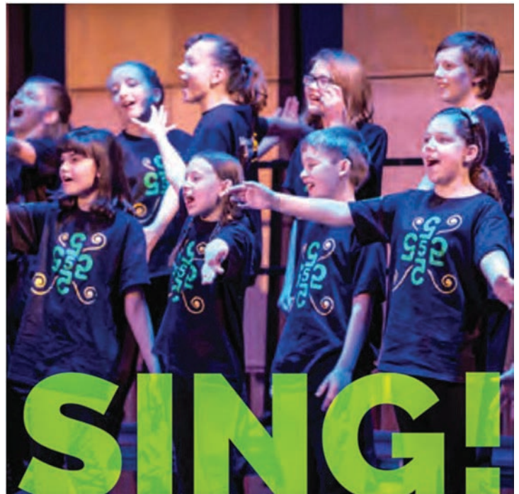
Duncan to Victoria. Vancouver Island Symphony Childrens Choir

As for economics, the VI Symphony is a non-profit, separate from the Port Theatre, with its own board of directors. It works in synergy with the Port Theatre, its principle venue. The symphony does extend its outreach throughout the island from Courtney/Campbell River to