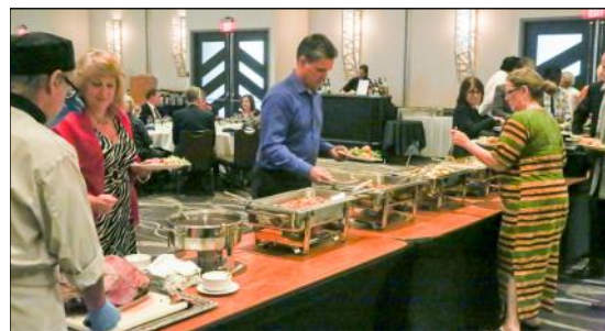
Our club met at the Coast Hotel last Friday to install club officers for the coming year and enjoy one of Coast's famous buffet dinners.