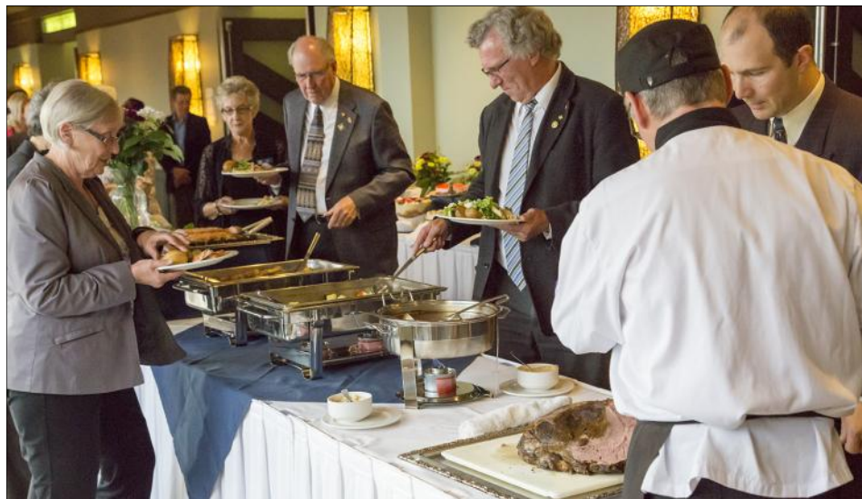
The Coast Hotel put on their usual scrumptious buffet for our installation dinner.