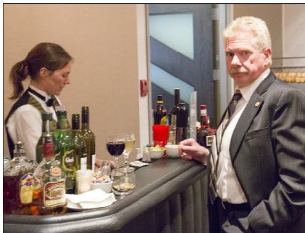
The emcee gets a well-deserved refreshment.