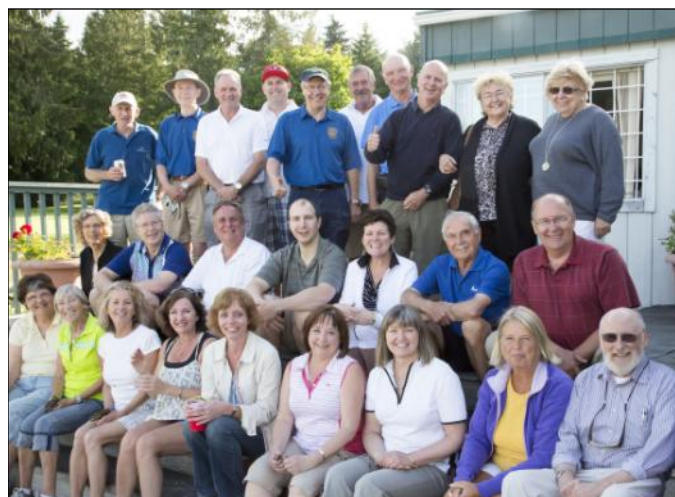
A good turnout for our Rotary Golf Tourney held at Winchelsea.