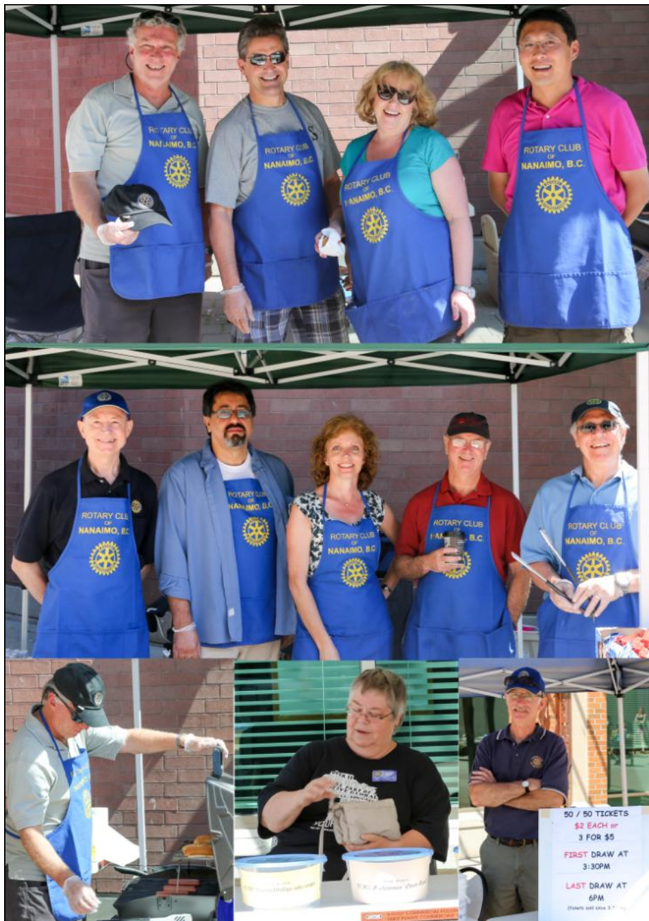
Rotarians who worked at "Battle of the Bands" on Saturday.