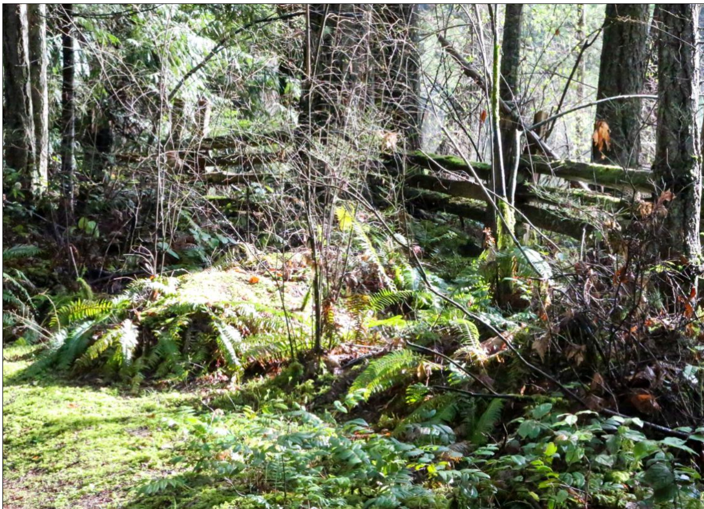
Afternoon sun filters through in Hemer Park -