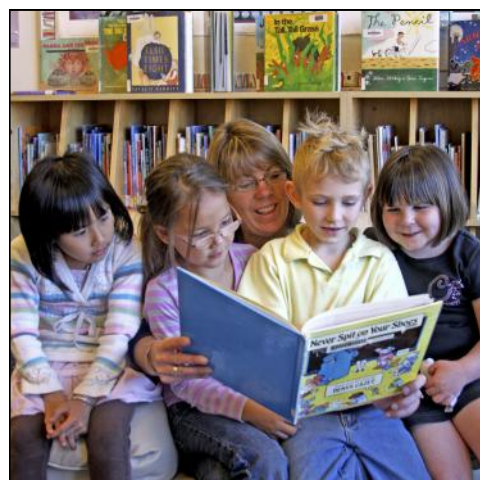
Children reading one of the many books donated by our Club to local schools

Worldwide, 67 million children have no access to education, and more than 775 million people over the age of 15 are illiterate. Our members support educational projects that provide technology, teacher training, vocational training teams, student meal programs, and low-cost textbooks to communities. Rotary International's goal is to strengthen the capacity of communities to support basic education and literacy, reduce gender disparity in education, and increase adult literacy.