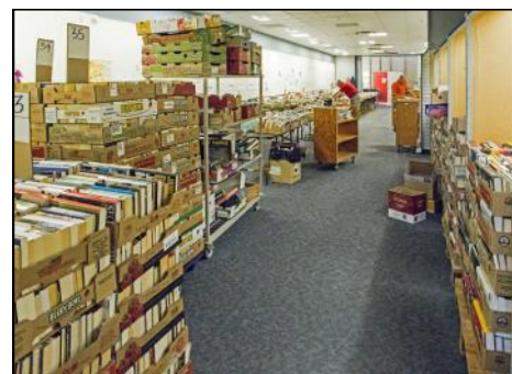
Books are sorted and loaded onto pallets throughout the year in preparation for our bi-annual book sales

The rate of low literacy skill among those in prison is three times that of the general population. We have supported programs at the local prisons by providing free books from our book sale inventory.