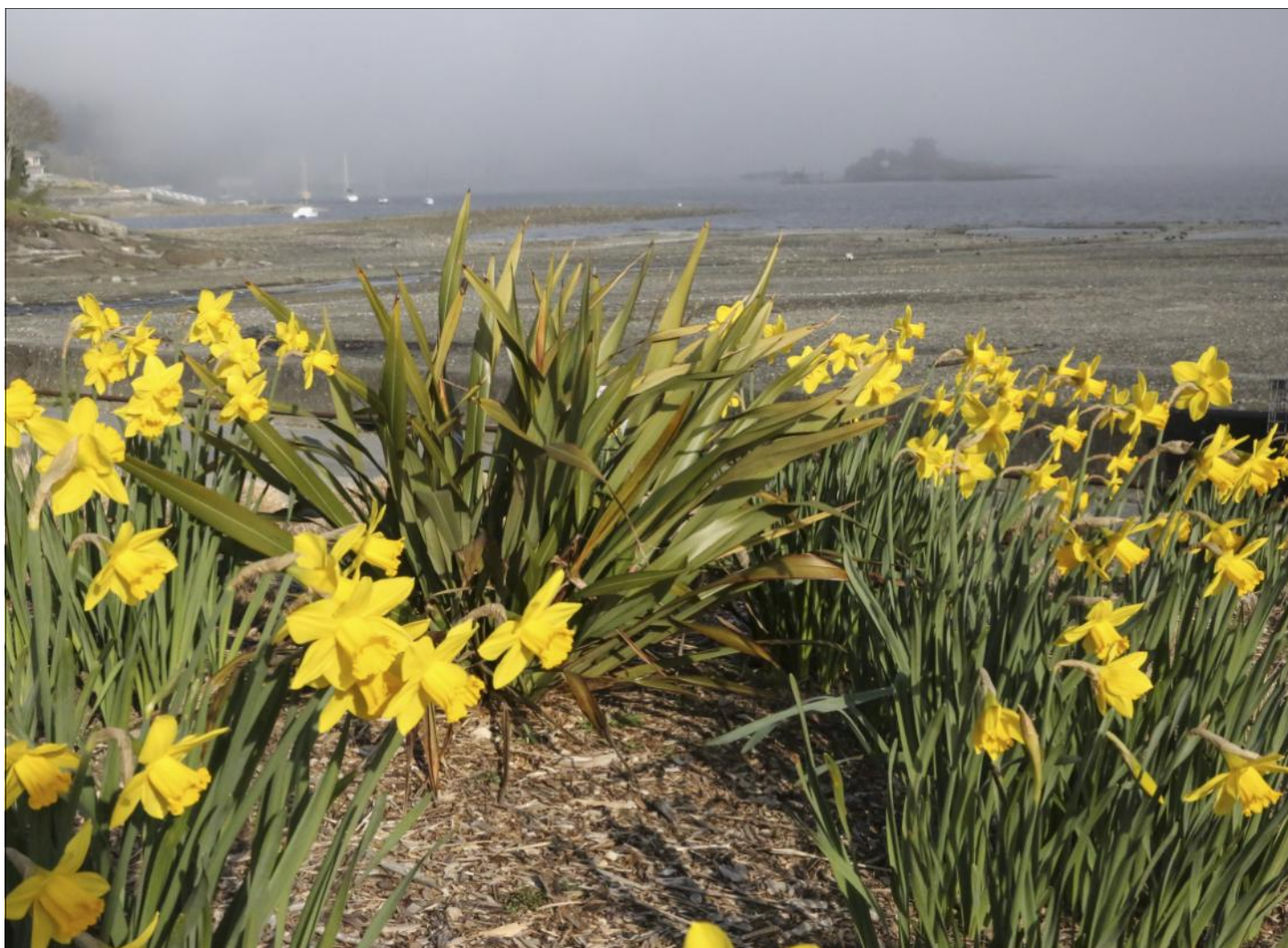
Departure Bay Daffodils in the fog ....