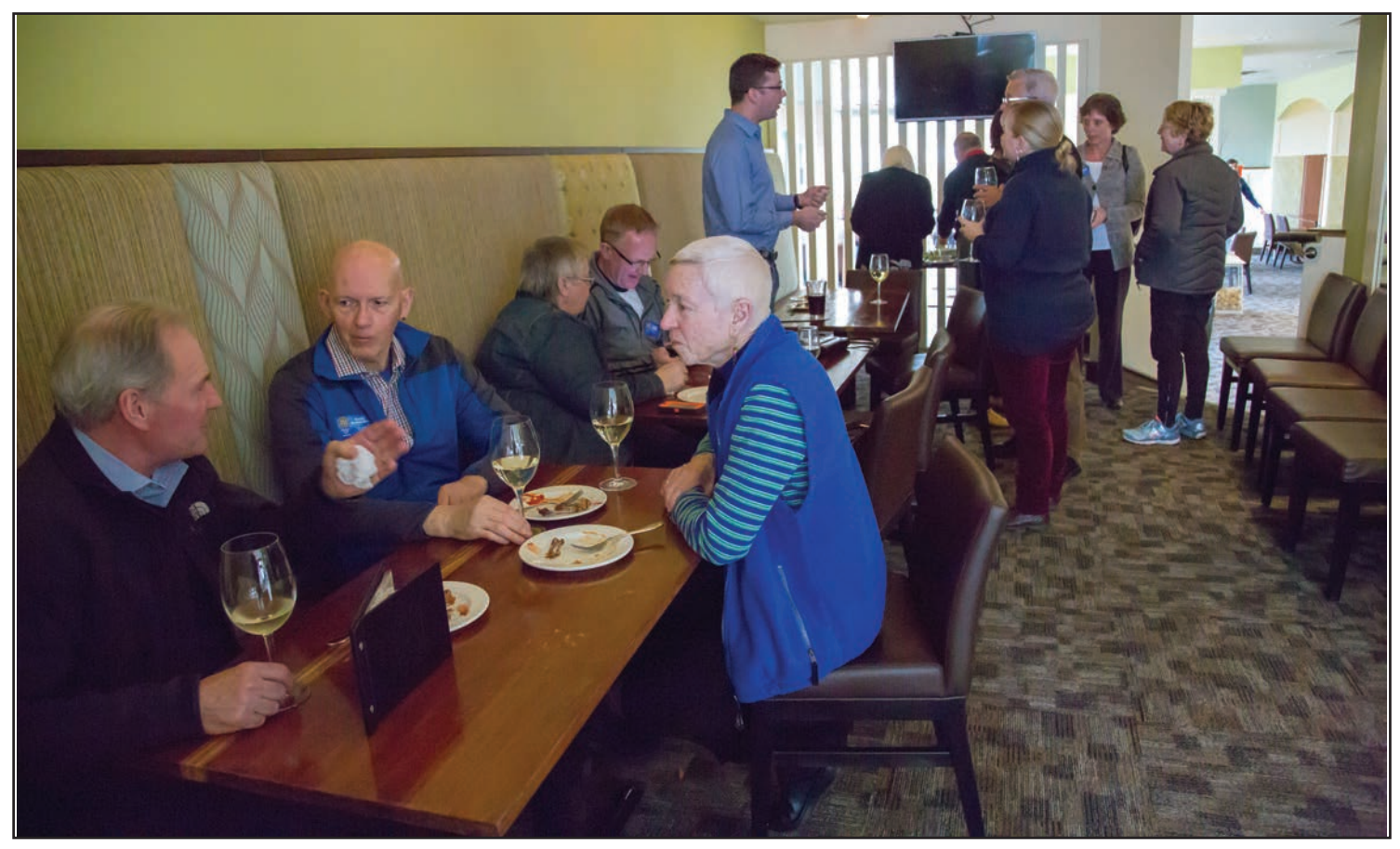
Rotary Happy Hour at the Coast Bastion, Monday March 12, 2018