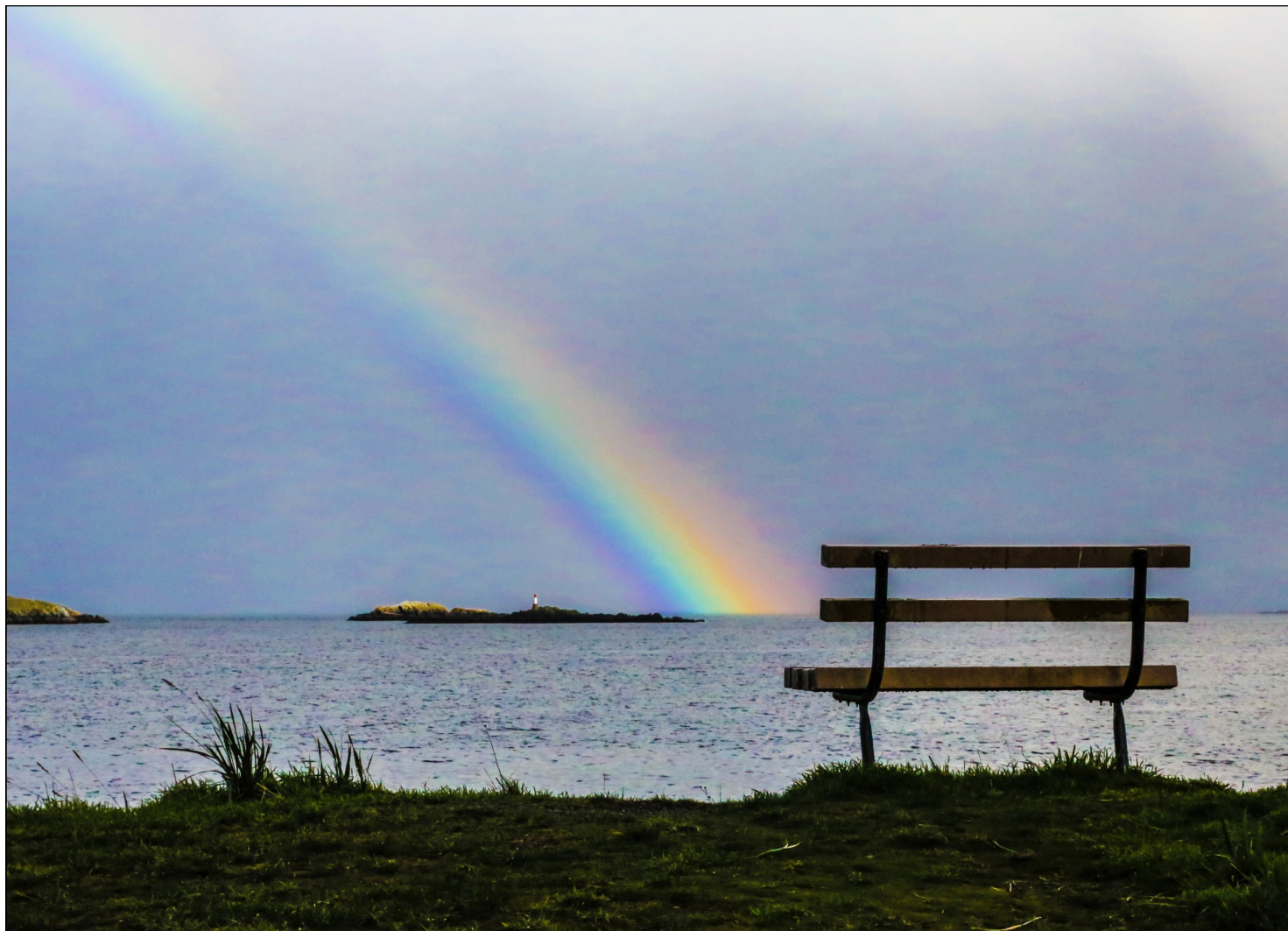
Late afternoon rainbow photographed from Piper's Lagoon - March 15 2016

Club Meeting Friday at 12:00 p.m. at the Coast Bastion Inn