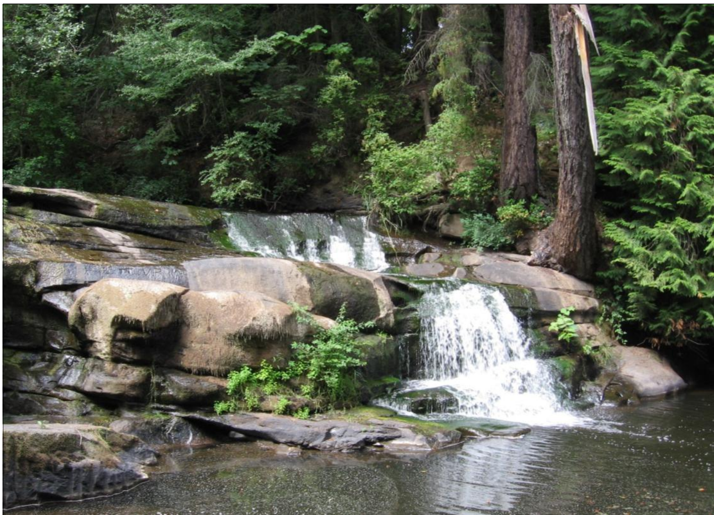
Spring comes to Bowen Park in Nanaimo—another local project supported by Rotary

Club Meeting Friday at 12:00 p.m. at the Coast Bastion Inn