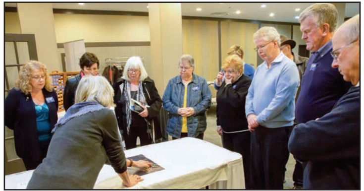
The Centennial Committee provides input to the Architect for our Club's 100th anniversary project.

Nothing is impossible, the word itself says "I'm possible"! - Audrey Hepburn