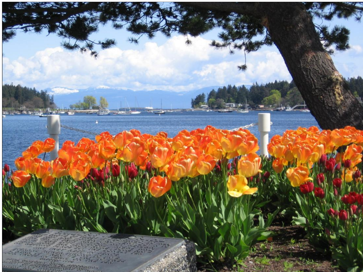
Tulips at the Sailors' Memorial, Swy-a-Lana Lagoon, Nanaimo

Club Meeting Friday at 12:00 p.m. at the Coast Bastion Inn