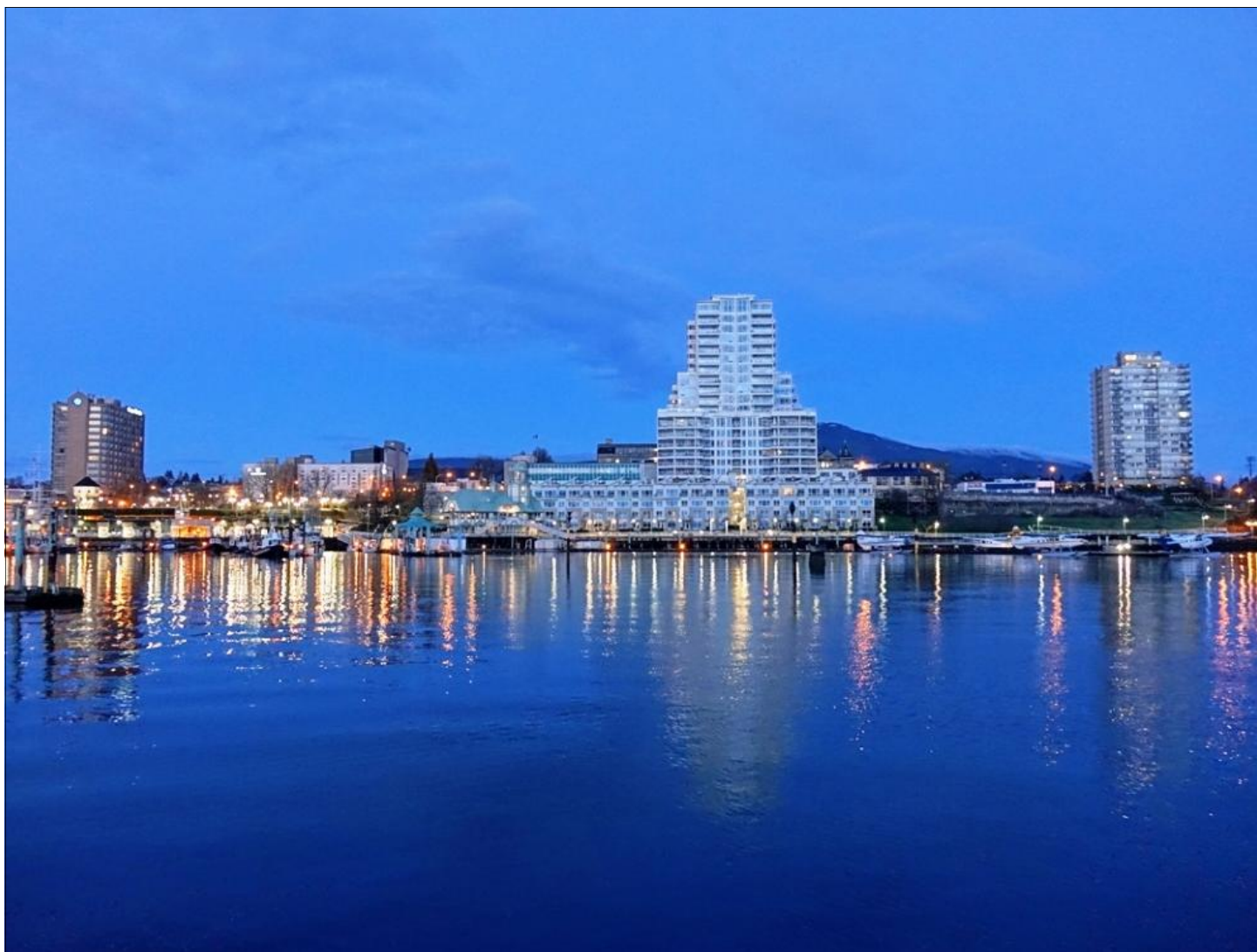
Downtown Nanaimo as seen from the inner harbour on a calm spring evening.

Club Meeting Friday at 12:00 p.m. at the Coast Bastion Inn