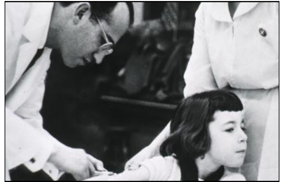
Dr. Jonas Salk vaccinates one of the first children

The impact on the rest of the world has taken longer. In 1988, when Rotary International launched the Global Polio Eradication Initiative (GPEI) with its partners at the World Health Organization, UNICEF, and the U.S. Centers for Disease Control and Prevention, polio continued to cripple children in 125 countries. Today, polio remains endemic in only three: Afghanistan, Nigeria, and Pakistan. And it has been more than eight