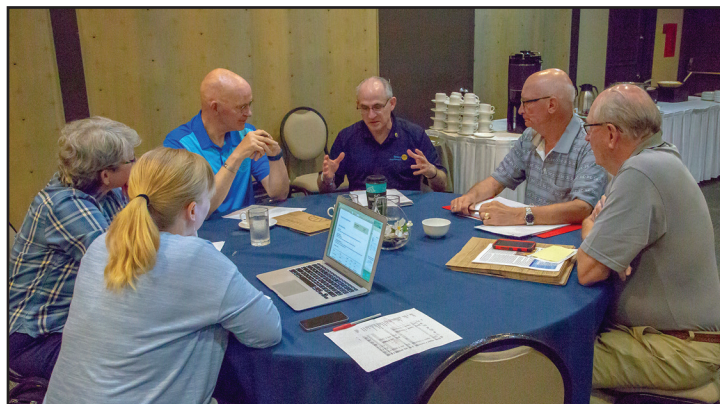
International Service Committee met following our regular meeting to discuss current projects and budget