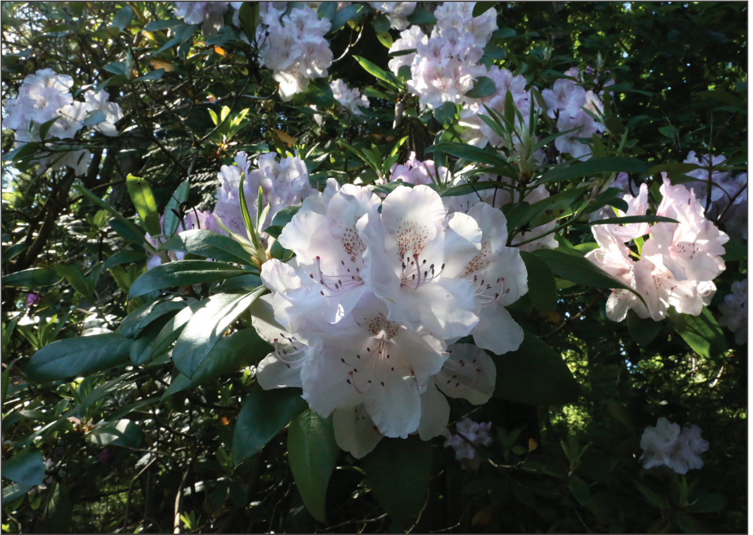
Nanaimo's Rhododendron Garden in Bowen Park - Photo taken May 23, 2018

Club Meeting Friday at 12:00 p.m. at the Coast Bastion Inn CLUB OFFICERS 2017-2018