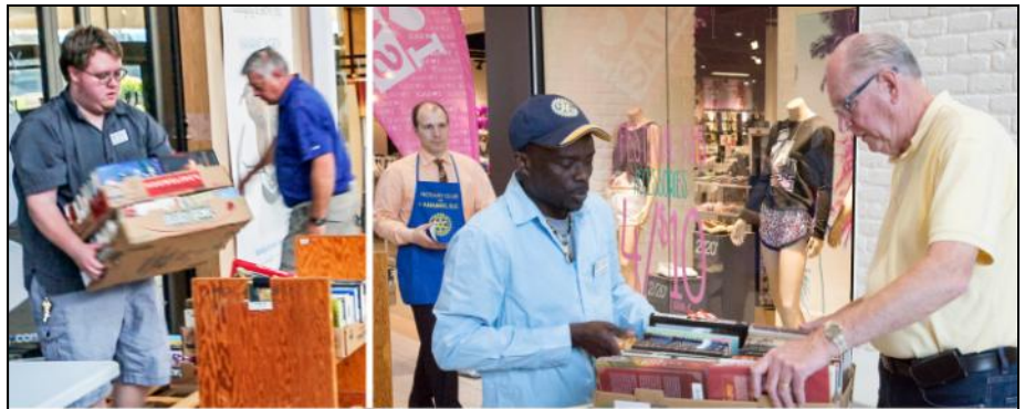
Rotarians, Rotaract and friends set up thursday night