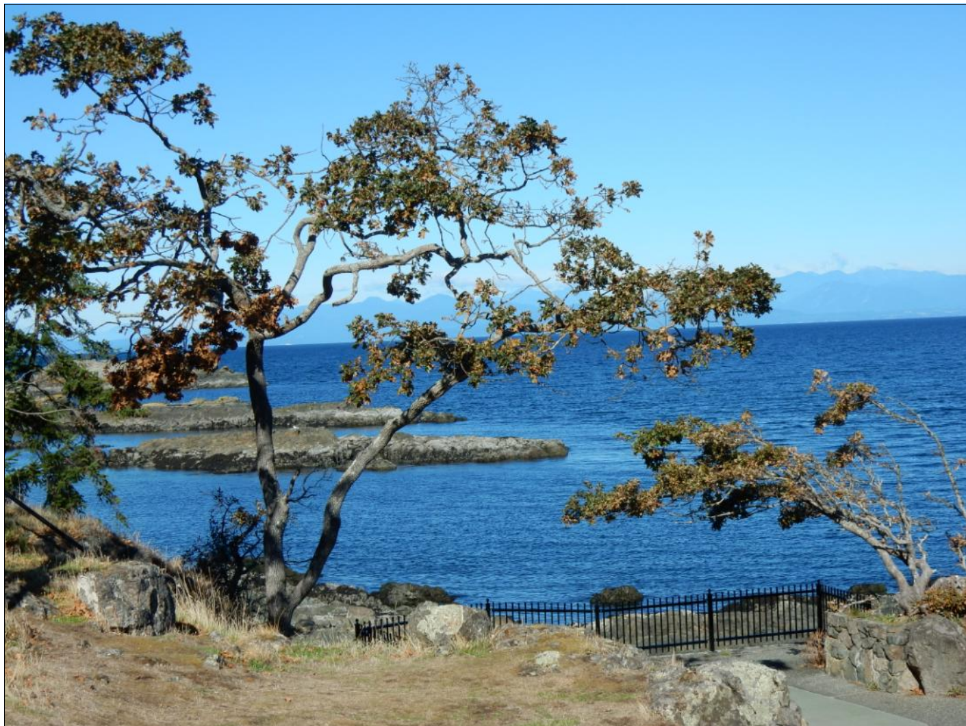
Neck Point Park in Nanaimo overlooking the Strait of Georgia and Mainland Mountains

Club Meeting Friday at 12:00 p.m. at the Coast Bastion Inn