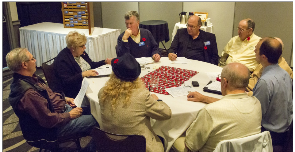
Following last week's meeting the Book Sale Committee met for a discussion on suggested improvements for our highly successful fund raiser.