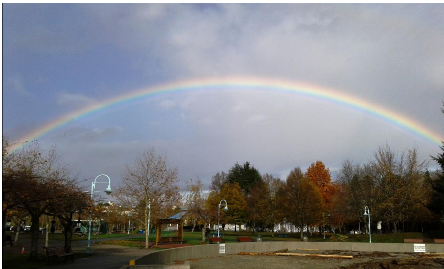
Rainbow across Maffeo Sutton Park in downtown Nanaimo— perhaps the last one this year!