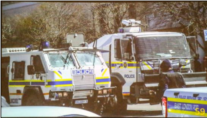
Police response to a inadvertent false alarm

Caren and Neil told us of lack of water when they were there recently. They had to use water from the swimming pool to flush the toilets! Their daughter talks about having candlelight dinners – sounds romantic but it is due to no electricity much of the time.