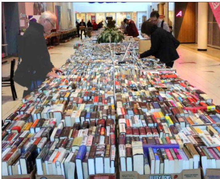
A small sampling of the 90,000 books that we offered for sale on opening day of the Rotary Book Sale. We continued to sort and add more books during the sale.