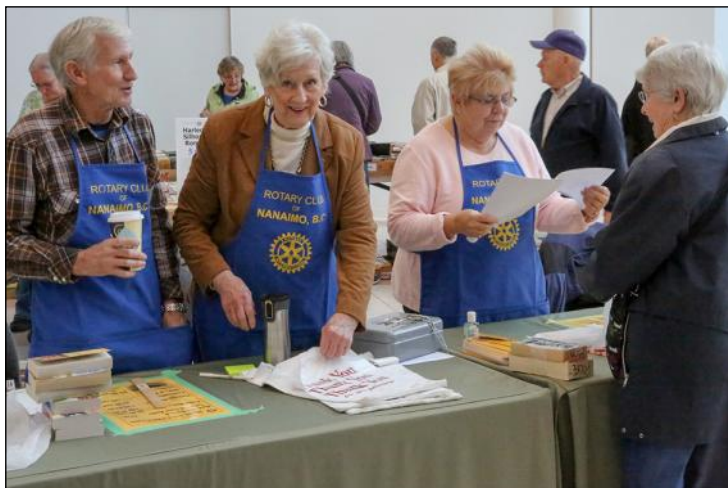
Our Rotary cashiers were very busy the first weekend of our book sale as record numbers of book-buyers came to take advantage of our tremendous bargains offered.

Of course, our buyers make it all possible, and we look forward to seeing them all in the spring of 2016!