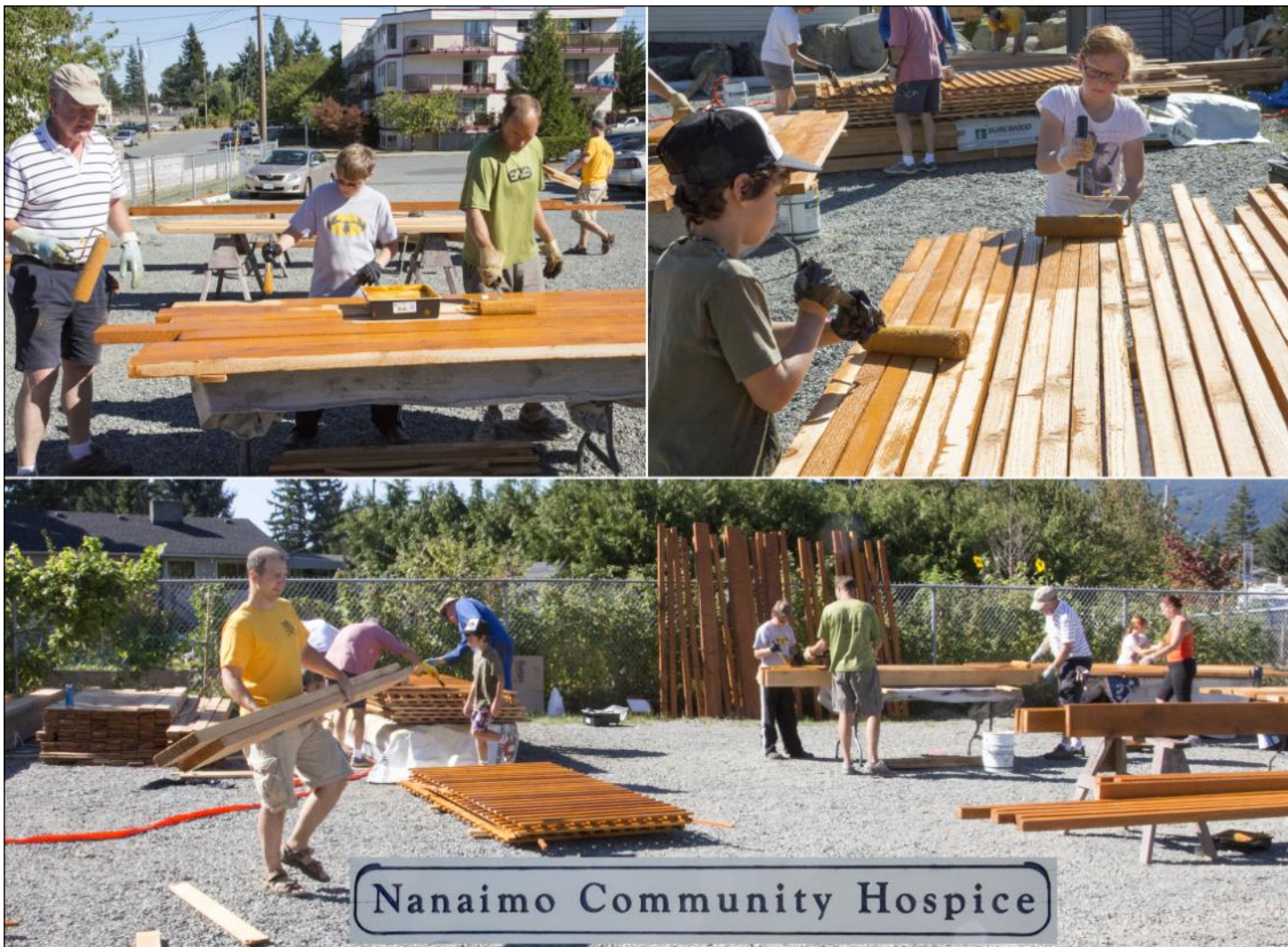
Nanaimo Community Hospice

Rotarians at work—Work party at Nanaimo Community Hospice building and painting fences.