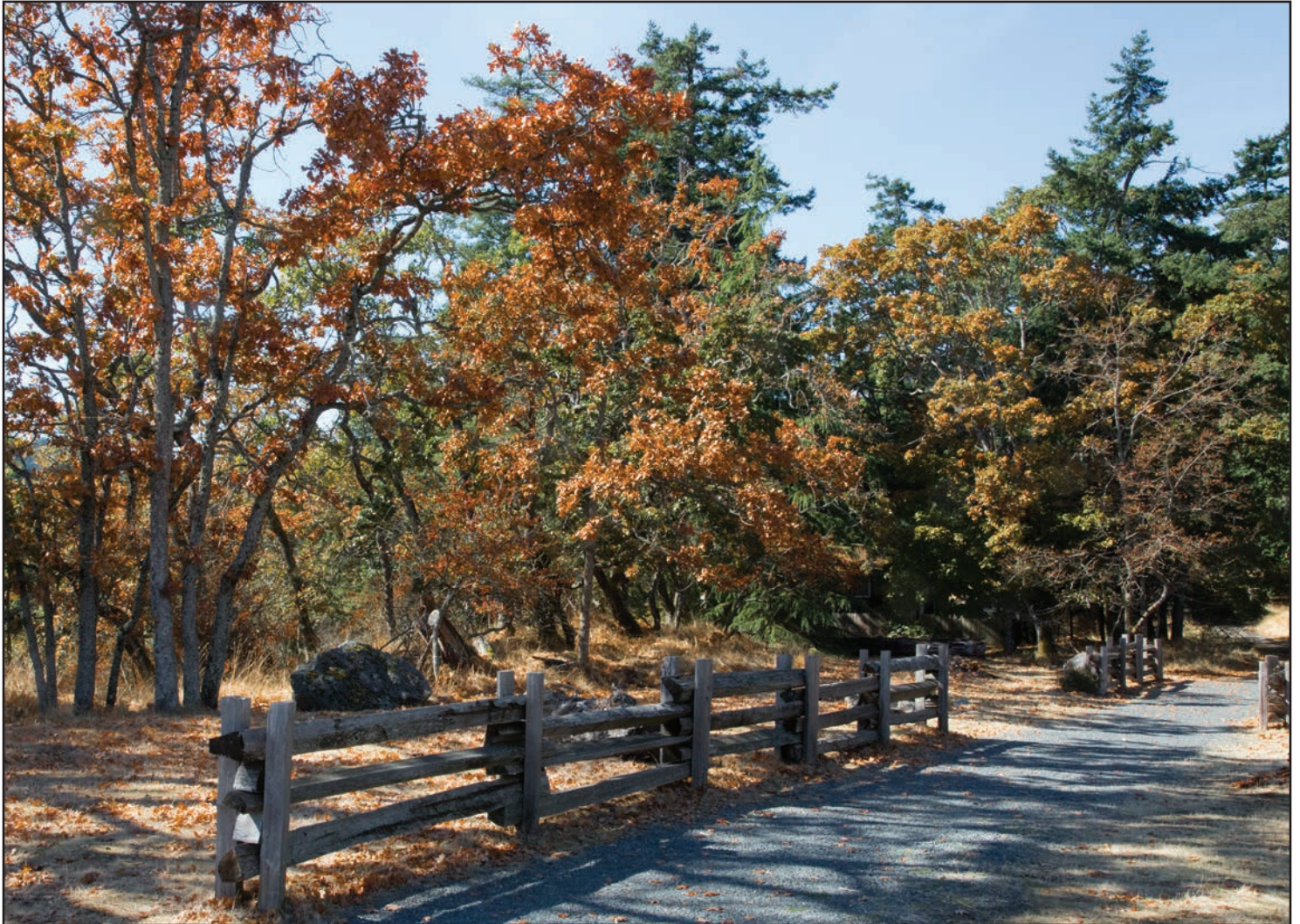
The colours of Fall are showing in Neck Point Park as we approach the Fall Equinox on Friday, September 22, 1:02 P.M. PDT