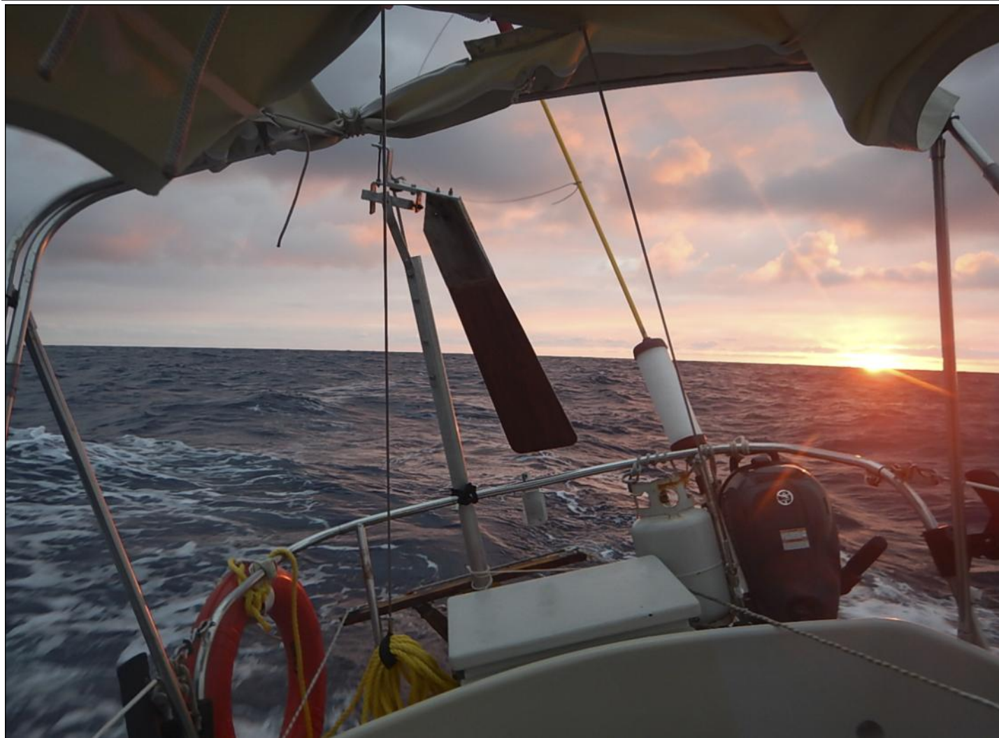
Sunrise on the Pacific Ocean during the voyage from Hawaii to Vancouver Island.