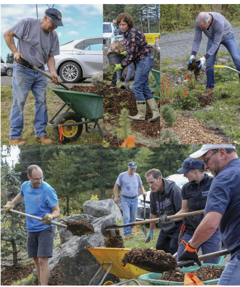
Bond. Families enjoyed a fun morning/afternoon with volunteers, including Rotarians from the 5 local Rotary Clubs, family, friends and 2 exchange students, in conjunction with Nanaimo Parks