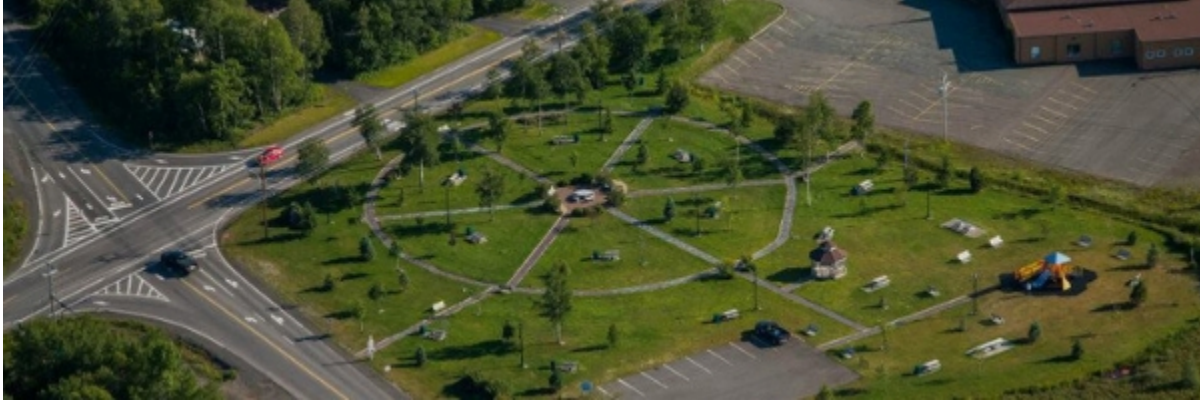
Rotary Club of Exploits - August 30 2018 Bulletin