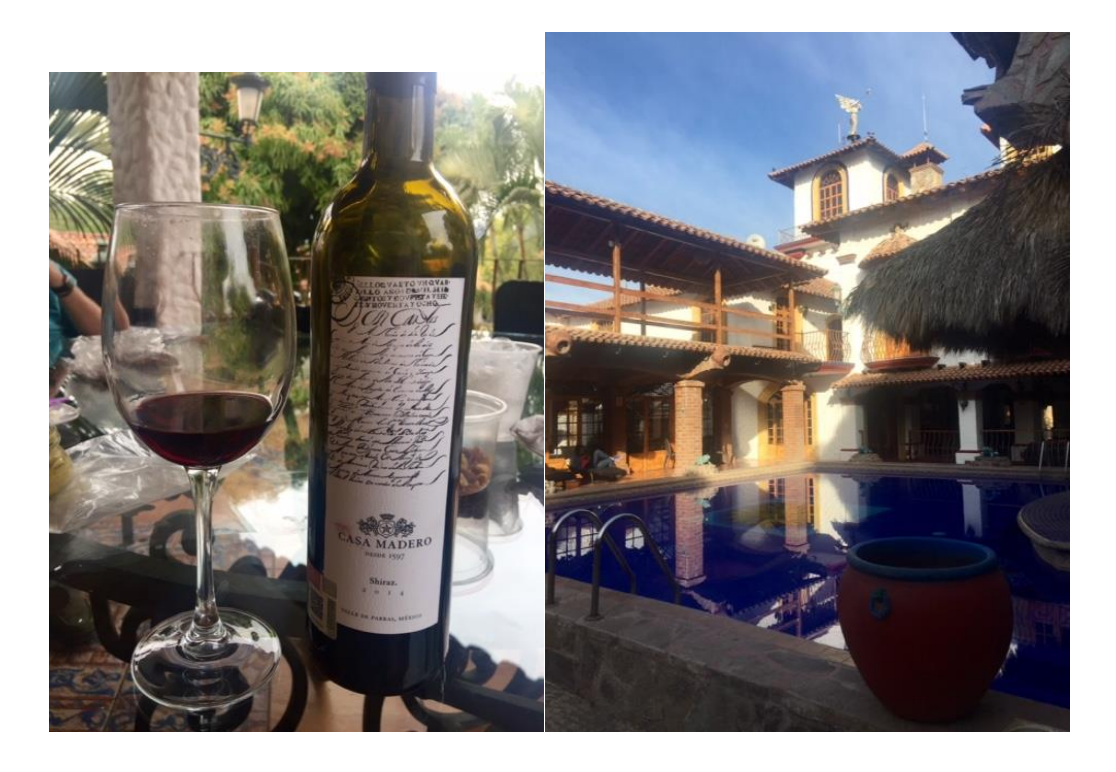
What a great way to end a fantastic trip.