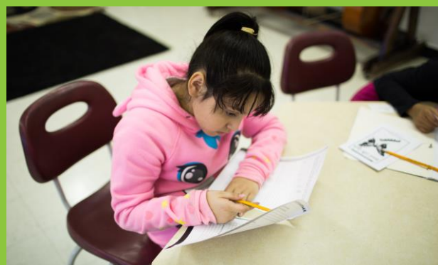
YONA students like Academic Time, but not as much as Expressive Arts...