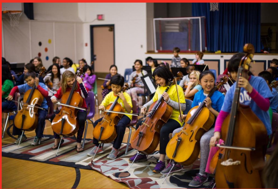
New String and Percussion students, receiving their instruments in September.