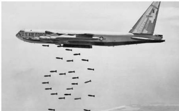
B-52 dropping cluster bombs

As of June 2019, we have provided 44 villages, schools and hospitals with almost 5,000 water filters, serving about 25,000 rural villagers. Where rural villages do not have access to a reliable water source, we augment our water filter program with the provision of permanent water supplies. This is usually done with dam construction, several kms of pipe, water tanks and taps throughout the villages.