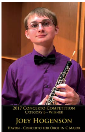
2017 CONCERTO COMPETITION CATEGORY B - WINNER

We are thrilled to listen to these outstanding young musicians at today's luncheon.