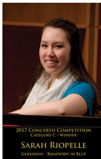
2017 CONCERTO COMPETITION CATEGORY C - WINNER