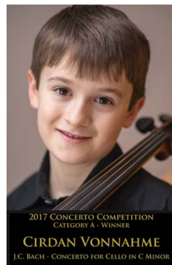
2017 CONCERTO COMPETITION CATEGORY A - WINNER