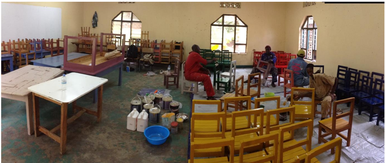
Donated furniture being painted by local contracts after preparation by the GHA Rotary Interact Club.