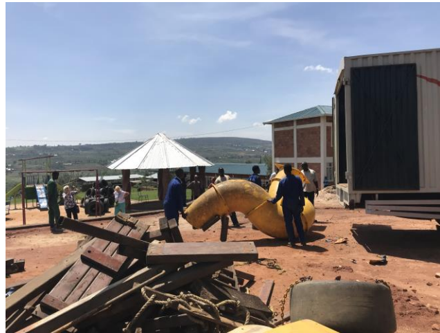
Playground equipment arriving at the Extra Mile Company Vocational training Centre for refurbishment.