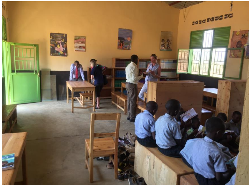
Nyamata Primary School Library and reading corner.

The Right to Read Rwanda Project included the establishment of libraries at 4 hub schools, including: Tare, Nemba, Rambo, and Nyamata Primary Schools. A reading corner was also established in the Nursery School at Nkora-Vumbi. The libraries established at each school included tables, chairs, book shelves, cabinets, book and reading resources, as well as training for librarians and teachers from each of the schools in how to administer and use libraries and library resources effectively in support of learning.