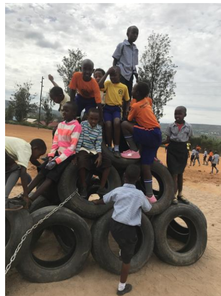
Happy students, teachers, and School Trustees at Nyamata Primary School.