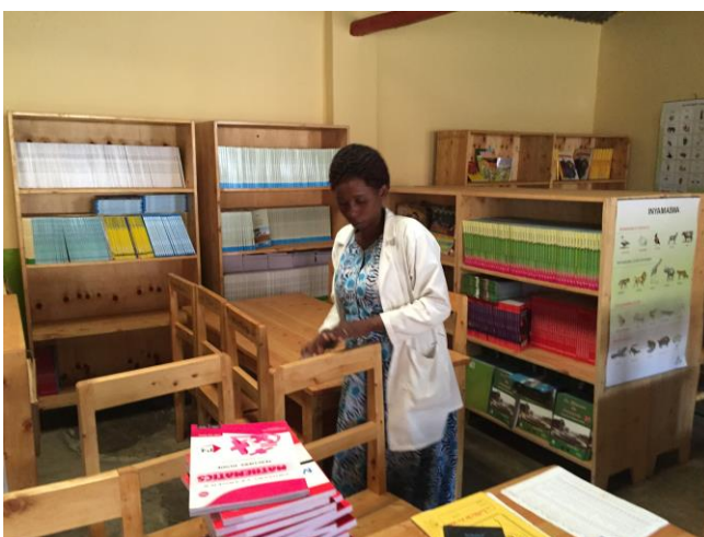
Library at Tare Primary School. Photo courtesy of Rotarian Libby Weir.