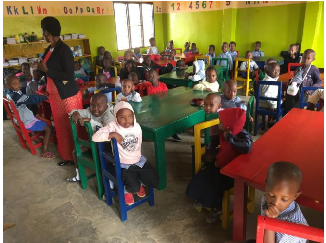
Refurbished school furniture in use at Nyamata Primary School.