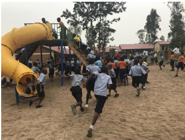
The finished product installed at Nyamata Primary School at the official playground opening in March, 2018.