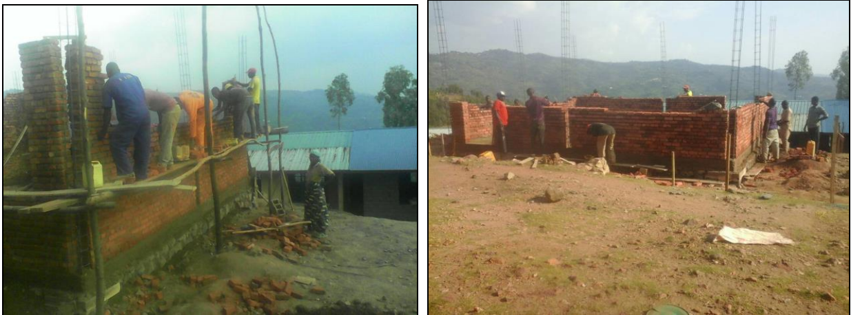
Primary school classroom under construction – December, 2017.