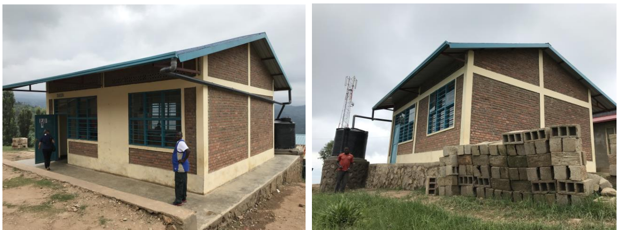
Completed primary classroom, April, 2019 – front and back views.