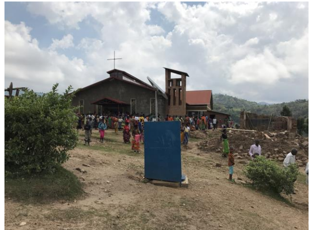
Naiade solar powered water filtration system at Busoro Primary School.