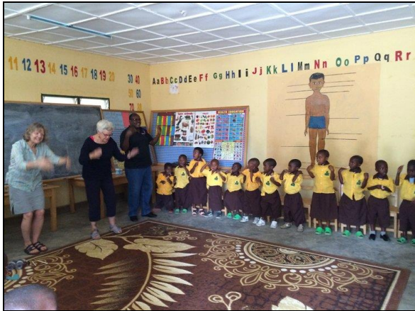
Exercises and song with the Nursery students