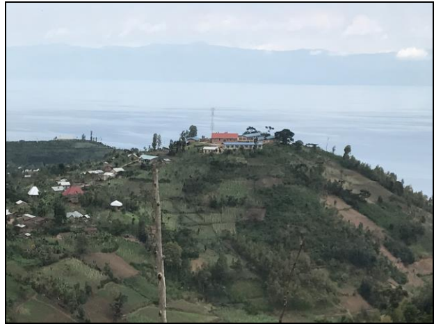
Primary 1 classroom build in 2018-19, with school perched up on the hills overlooking Lake Kivu in Western Rwanda.