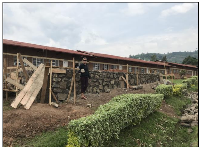
Site preparations and classroom foundation on December 25, 2018, with Rotarian Libby Weir for scale.