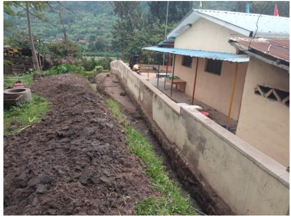
Drainage and path repairs inside school property as well as drainage ditch on exterior of wall.