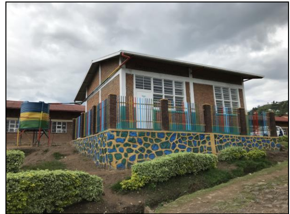
Completed nursery classroom and water tank - March, 2019.