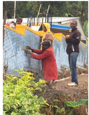
New and repaired rain gutters, paint inside and out and landscaping to assist water drainage.