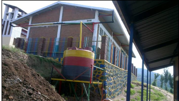
Completed Nursery classroom and water tank, March, 2019.