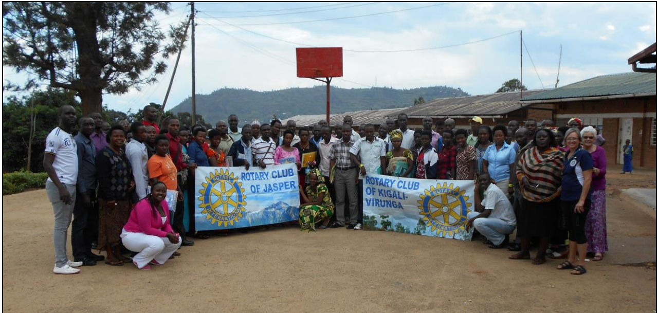
Teachers at completion of training workshop in November, 2015.