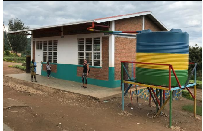
Completed nursery school classroom and water tank – May, 2019.