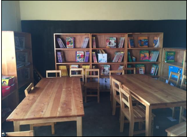
Library established in 2016-17.