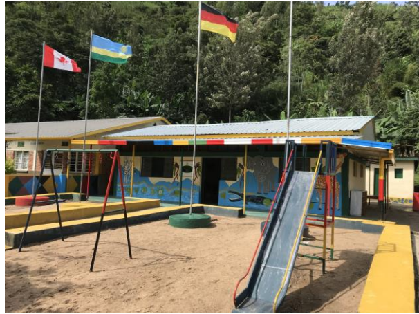
The finished project in May, 2019 with fresh and bright colors – fence, swings and exterior of school.