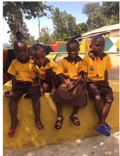
The beneficiaries of all the work – nursery students with one of their teachers in the classroom (L), mother who works for CAFERWA Coffee Washing Station dropping off her children (centre), and in their new uniforms outside the Nursery School (R).