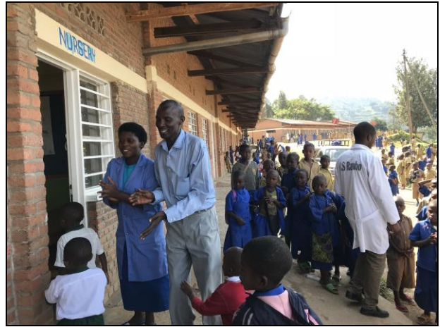
Nursery Classroom, students and teacher. Headmaster and primary students outside nursery classroom.