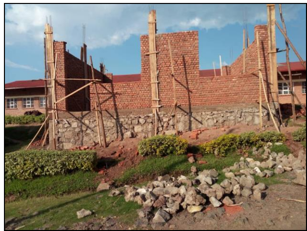
Under construction – January and February, 2019.