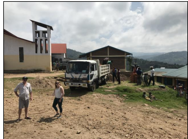
Classroom site preparations and construction materials arriving on site on December 26, 2018. Being constructed next to Primary 1 classroom built last year.