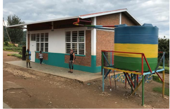
Busoro and Rambo Primary Schools – 5,000 litre water catchment and storage tanks at each of the new nursery school classrooms.