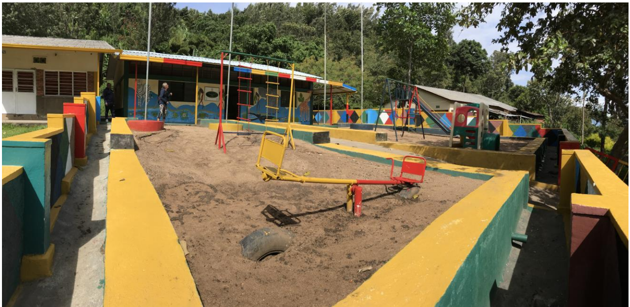
The finished product – panorama view, with Rotarian Libby Weir.