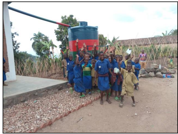
Completed nursery classroom and watertank, along with some appreciative nursery and primary school students - April, 2019.