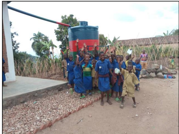
Kinigi Primary School Water Tank – installed adjacent to the Nursery School Classroom, harvesting rainwater from the classroom roof.