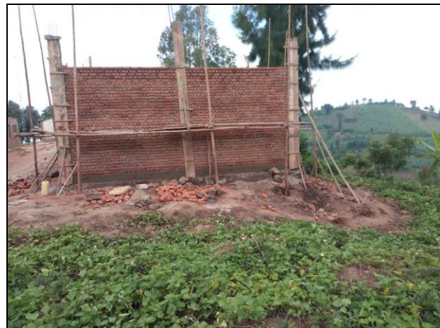
Under construction – January, 2019.