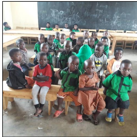
Completed nursery classroom and furniture – with nursery school students! April, 2019.