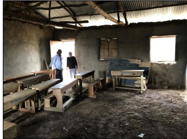
Old Nursery Classroom, now used for storage – note no windows, dirt floor and storage of old and broken furniture.

The school was also identified for an additional water storage tank as it only has two 5,000 litre water storage tanks and 1 water station for more than 1,100+ students and teaching staff.