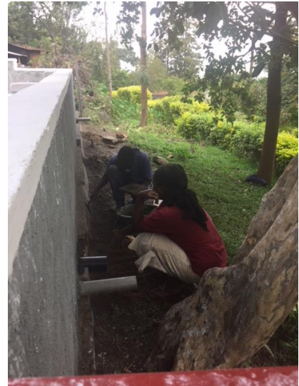
New drainage ditches inside property fence, with new sand fill brought up from Lake Kivu (in background).