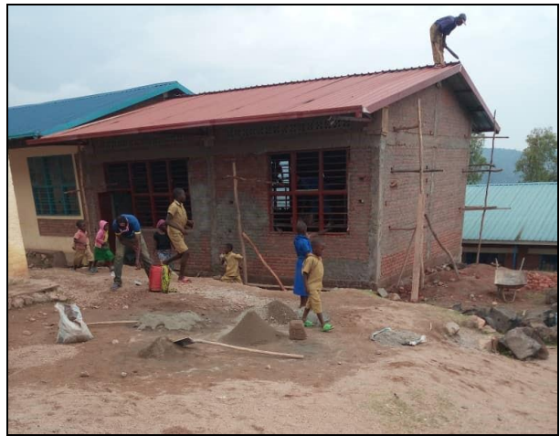
Under construction – January, 2019.