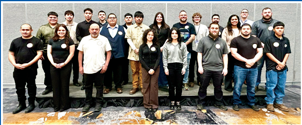
2025 Vocational Scholarship Recipients