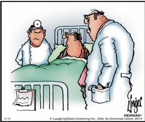
"You've got to start sometime. Why don't you operate on this one?"

when i was a kid, my parents would always say "Excuse my French" just after a swear word... I'll never forget my first day at school when my teacher asked if any of us knew any French.