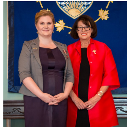
Sovereign's Medal for Volunteers 2018

History of Access Youth In 1993 PoCoMo Youth Services Society was incorporated, providing supports and services to youth ages 12 to 18 living in Port Moody, Coquitlam, and Port Coquitlam. In 2013 our agency expanded its services and programs outside of the Tri Cities and required a name that was inclusive to the new communities and youth we serve. PoCoMo Youth became Access Youth Outreach Services Society and continues to