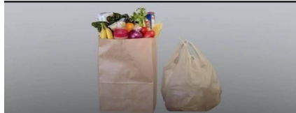
I'M OLD ENOUGH TO REMEMBER WHEN PAPER BAGS WERE BEING BLAMED FOR THE DESTRUCTION OF TREES – AND PLASTIC BAGS WERE THE SOLUTION!