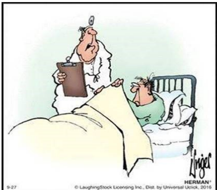
"Sorry about the two scars. We had your X-ray upside down for a while."