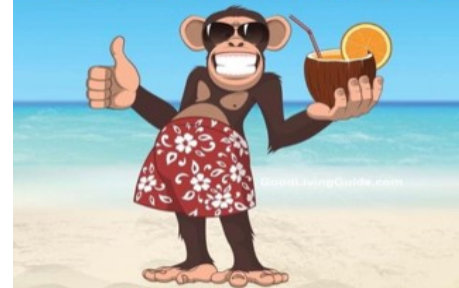
the less we care!

THOSE WHO CONFUSE BURRO AND BURROW DON'T KNOW THEIR ASS FROM A HOLE IN THE GROUND