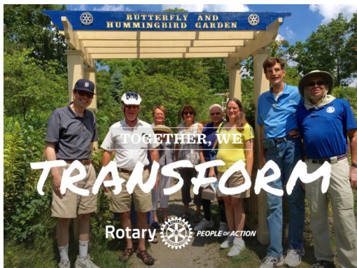
RCAAN members cleaning up the Butterfly Garden Project at Gallup Park