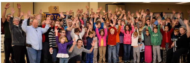
Rotarians working with the community to pack 10,000 meals for the Kids Coalition Against Hunger