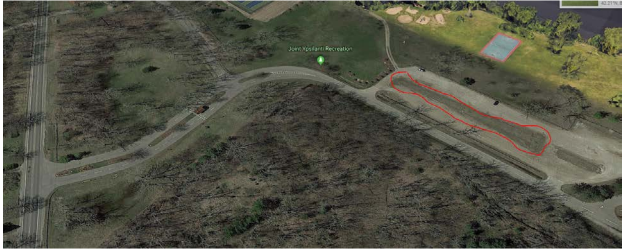
4. Civic Center 7200 S. Huron River Dr.

8 Ivory Silk Lilac - planted in the Parking Lot Berm - easy to spot.