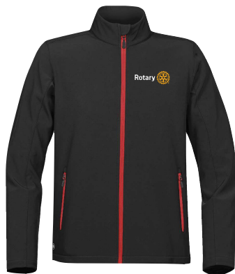
Orbiter Softshell - KSB-1

Soft Shell Jackets-Item cost INCLUDES Rotary logo but not club name. To add club name is $4.00 each and order must be a minimum of 6 items.