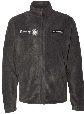
Columbia Fleece Jacket 147667 Mens