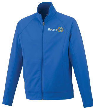
Okapi Knit Jacket 18117