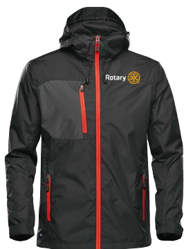
Olympia Shell - GXJ-2

Prices S-XL. 2XL adds $2.50. 3XL and up adds $5.