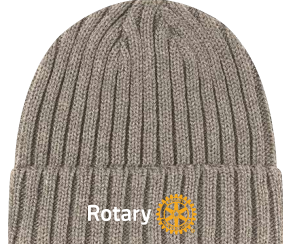
9Z590M Chunky Cuffed Toque