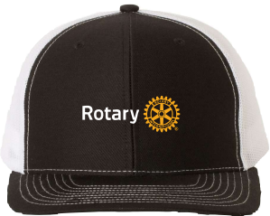
Richardson - Snapback Trucker Cap - 112