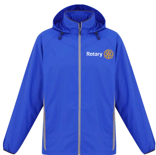
Breeze Jacket J930M