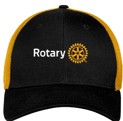
NE1020 New Era Stretch Mesh