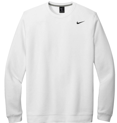
NIKE® Club Crew CJ1614