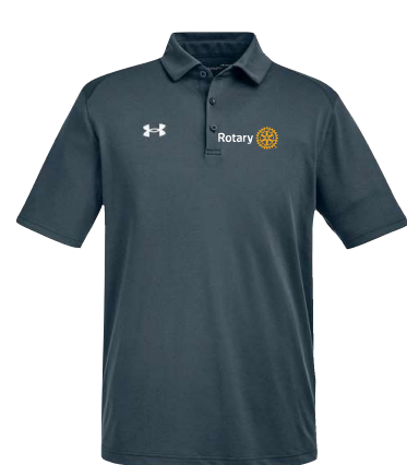
Under Armour Tech 1370399