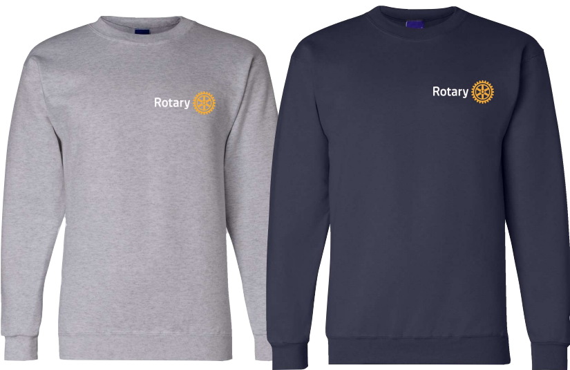
Pictured in Champion S600.

Prices S-XL. 2XL adds $2.50. 3XL and up adds $5.