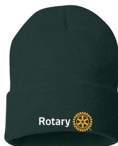
Sportsman - Solid 12" Cuffed Beanie - SP12