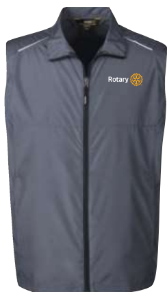
Lightweight Vest CE703

Vests-Item cost INCLUDES Rotary logo but not club name. To add club name is $4.00 each and order must be a minimum of 6 items.