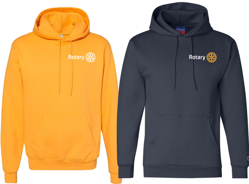
Pictured in Champion S700.

Prices S-XL. 2XL adds $2.50. 3XL and up adds $5.