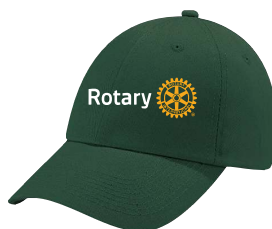
6F630M Deluxe Chino Twill Cap