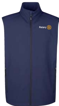
Soft Shell Vest CE701