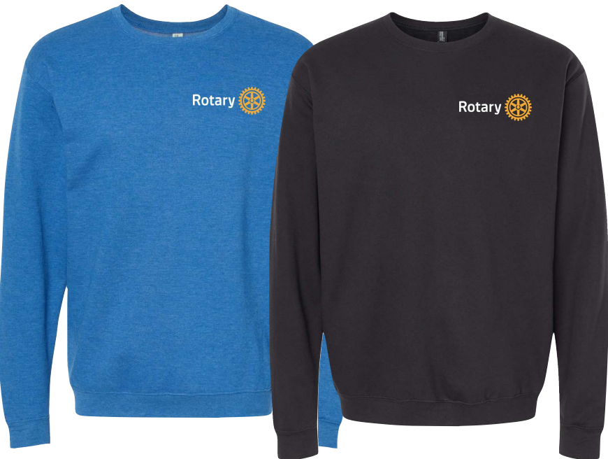
Pictured in M&O 3340