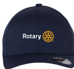
Flexfit - Fitted Cap - 6277