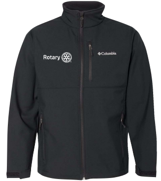
Columbia - Ascender™ Softshell Jacket - 155653