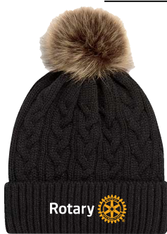
9L594L Womens Faux Fur Pom Pom