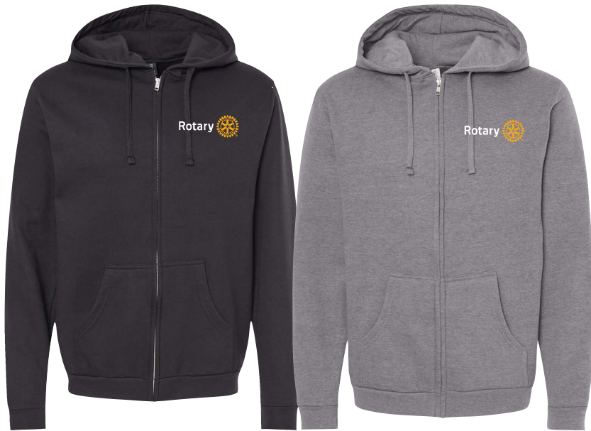
Pictured in M&O 3331

Zip Hooded Sweatshirts-Item cost INCLUDES Rotary logo but not club name. To add club name is $4.00 each and order must be a minimum of 6 items.