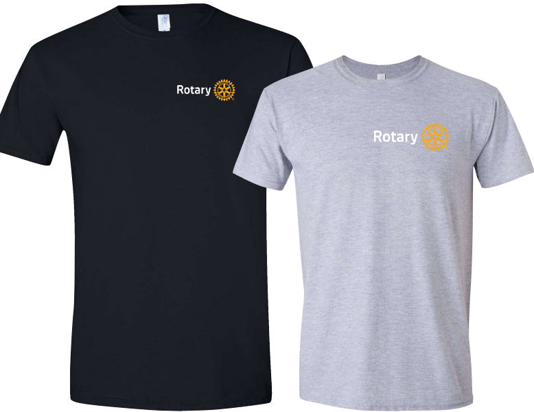
Pictured in 64000 Softspun.