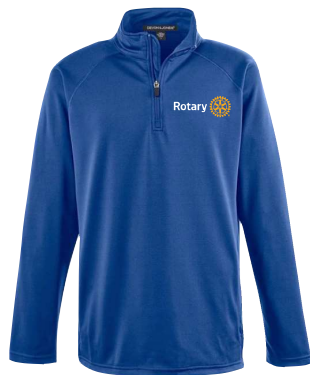
DG440 Tech Shell