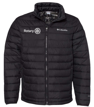
Columbia - Powder Lite Jacket - 169800