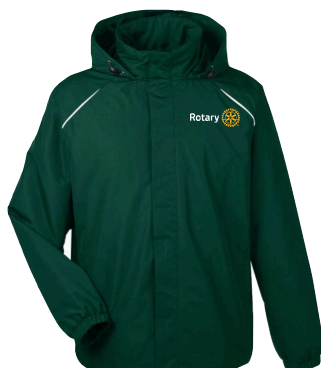
All-Season Jacket 88224

Insulated Jackets-Item cost INCLUDES Rotary logo but not club name. To add club name is $4.00 each and order must be a minimum of 6 items.