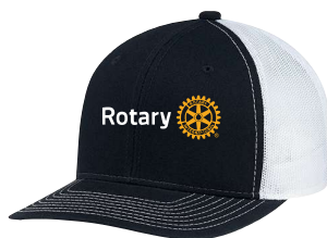
8E019M Trucker Cap