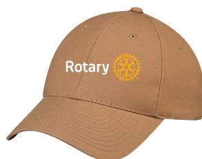
7D630M Duck Canvas Work Cap

Caps-Item cost INCLUDES Rotary logo but not club name. To add club name is $4.00 each and order must be a minimum of 6 items.