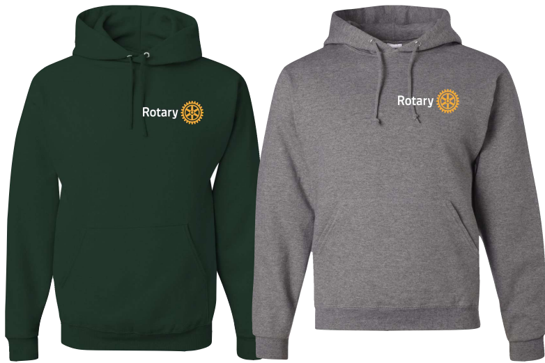
Pictured in 996 Jerzees.

Hooded Sweatshirts-Item cost INCLUDES Rotary logo but not club name. To add club name is $4.00 each and order must be a minimum of 6 items.