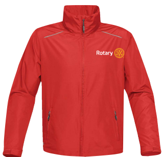
Performance Shell - KX-1