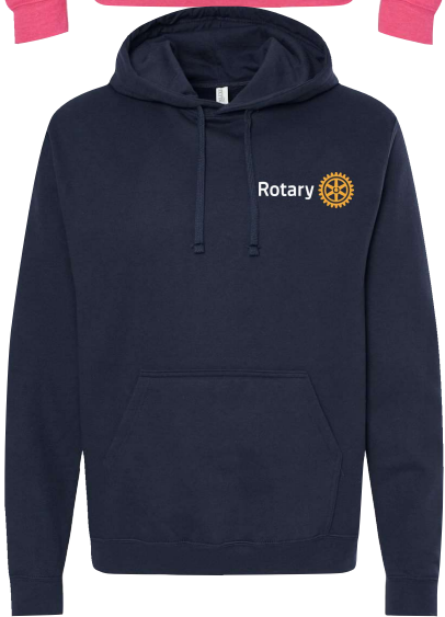
Pictured in M&O 3320