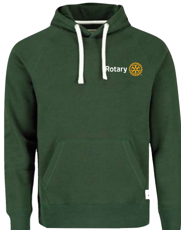
Roots Mens Hoodie 18215