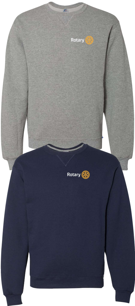
Pictured in Russell 698M