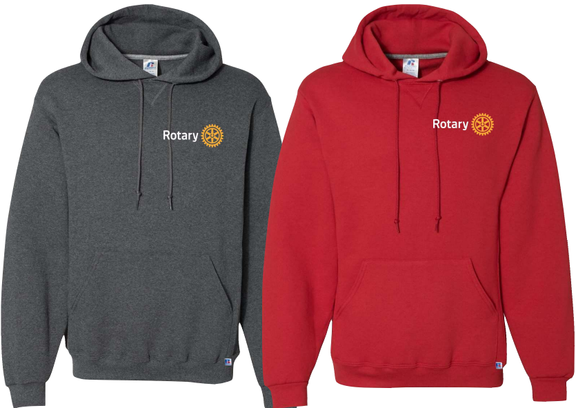
Pictured in Russell 695M