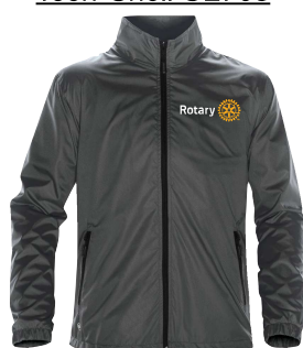
Axis Shell - GSX-1

Prices S-XL. 2XL adds $2.50. 3XL and up adds $5.