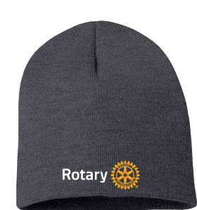
Sportsman - 8" Knit Beanie - SP08