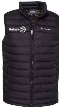
Columbia - Powder Lite Vest - 174803