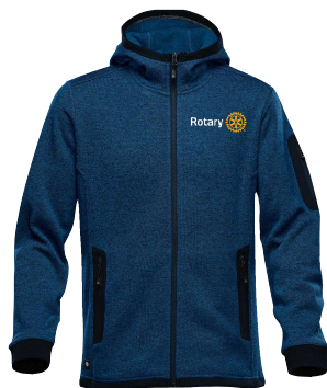
Juneau Knit Hoody - FH-2

Fleece Jackets-Item cost INCLUDES Rotary logo but not club name. To add club name is $4.00 each and order must be a minimum of 6 items.