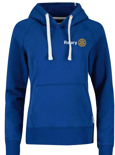
Roots Womens Hoodie 98215