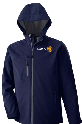
Soft Shell Hooded 88166