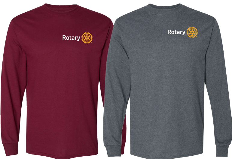
Pictured in 8400 Dryblend.