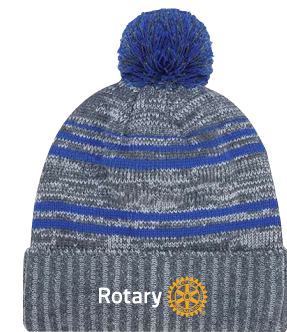
9G087M Fleece Lined Striped Pom Pom