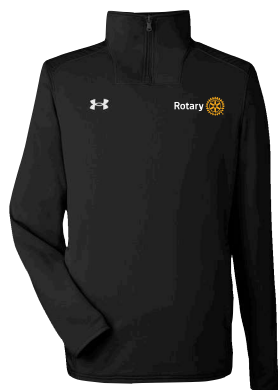
1360712 Under Armour Command