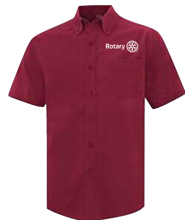
D6021 Coal Harbour

Button Down Shirts-Item cost INCLUDES Rotary logo but not club name. To add club name is $4.00 each and order must be a minimum of 6 items.