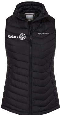
Columbia - Women's Powder Lite™ Vest - 175741