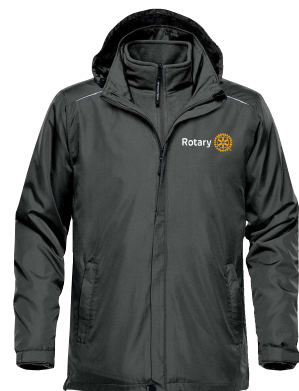
Nautilus 3-In-1 Jacket

Insulated Jackets-Item cost INCLUDES Rotary logo but not club name. To add club name is $4.00 each and order must be a minimum of 6 items.