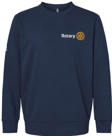
Adidas Crew A434

Prices S-XL. 2XL adds $2.50. 3XL and up adds $5.