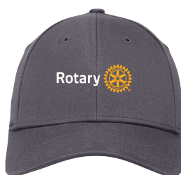
NEW ERA® Fitted Cap NE1000