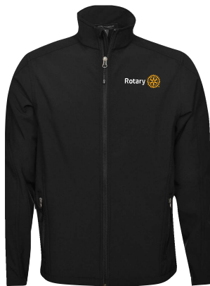
Soft Shell J7603