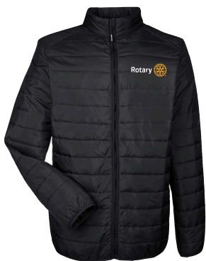
Puffer Jacket CE700

Waterproof Jackets-Item cost INCLUDES Rotary logo but not club name. To add club name is $4.00 each and order must be a minimum of 6 items.