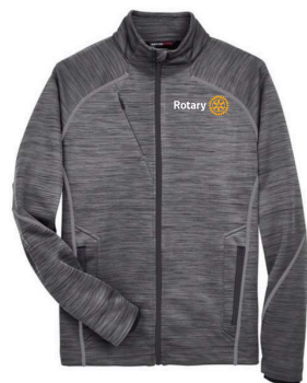
Bonded Fleece Jacket 88697