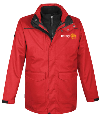
Vortex HD 3-In-1 Parka