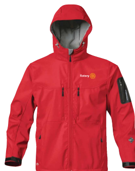
Epsilon H2X Shell - HS-1