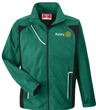
Dominator Jacket TT86