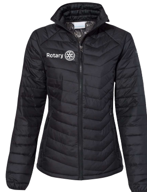
Columbia - Women's Powder Lite Jacket - 169906