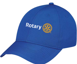
1B630M Polyester Rip Stop Cap