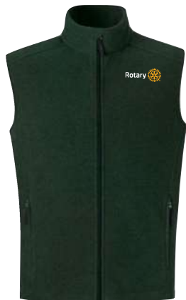
Fleece Vest 88191