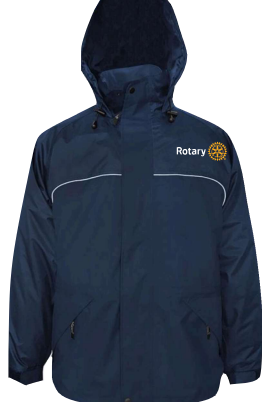
Viking Insulated Torrent 830