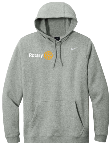
NIKE Club Pullover Hoodie CJ1611