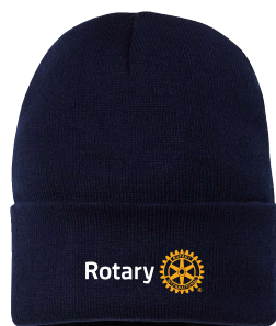
Sportsman - Fleece Lined SP12FL