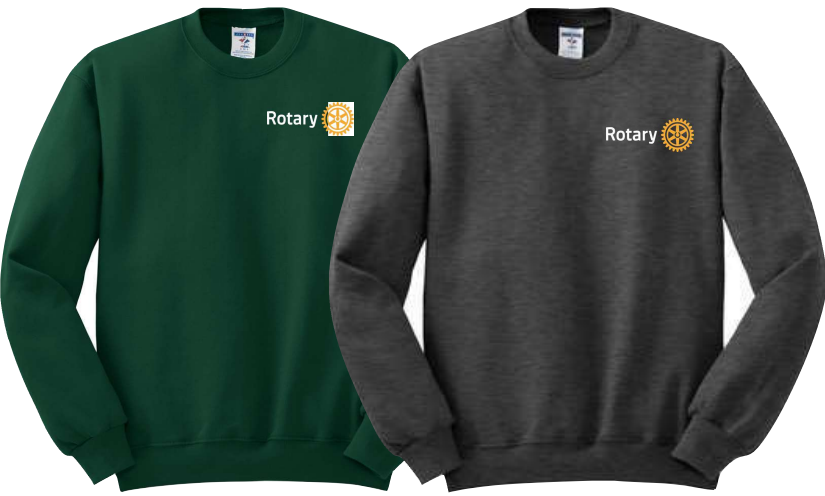
Pictured in Jerzees 562.

Crew Sweatshirts-Item cost INCLUDES Rotary logo but not club name. To add club name is $4.00 each and order must be a minimum of 6 items.