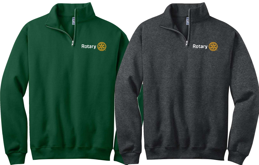
Pictured in 995 Jerzees.

Prices S-XL. 2XL adds $2.50. 3XL and up adds $5.