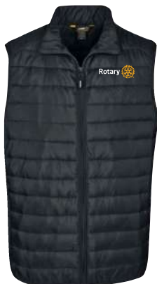
Puffer Vest CE702