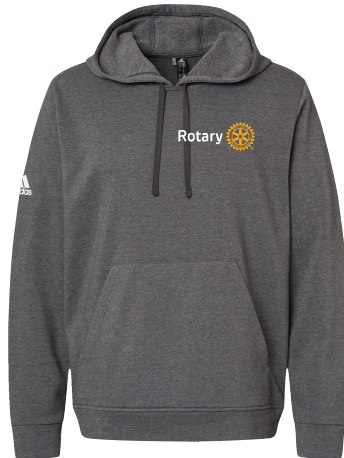
Adidas Hood A432