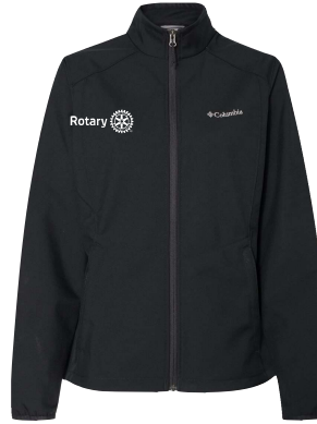
Columbia - Women's Kruser Ridge™ Softshell 177191