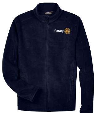
Journey Fleece Jacket 88190