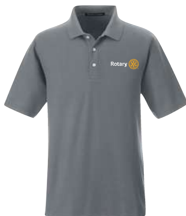
DG150 Devon & Jones