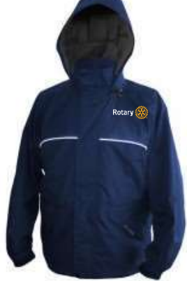
Viking Lined Torrent 828