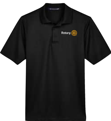
DG20 Devon & Jones