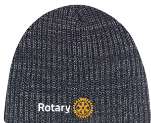
1A133M Chunky Board Toque