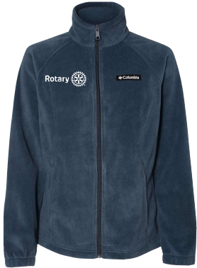
Columbia Fleece Jacket 137211 Womens

Prices S-XL. 2XL adds $2.50. 3XL and up adds $5.