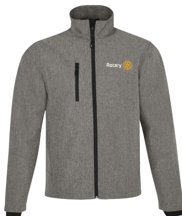
Premier Soft Shell J0760