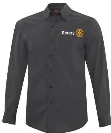
D6013 Coal Harbour