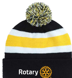
9S243M Striped Rib Knit Pom Pom

Toques-ADD decoration charges see back page. Item cost INCLUDES Rotary logo but not club name. To add club name is $4.00 each and order must be a minimum of 6 items.