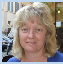
Tracy Business Owner