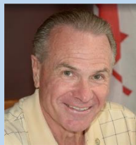
David Engineering Consulting