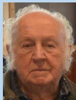
Dave Fire Protection