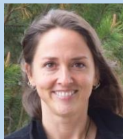
Tara Renewable Energy