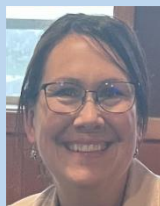
Kelly Business Lending