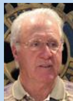
Don Travel Services