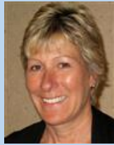
Cindy Marine Insurance