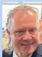
Danny Funeral Homes