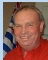
Gary Hardware Supply