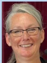
Colleen Interior Design