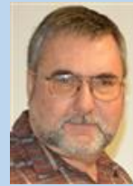
Craig Sporting Goods