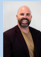
Scott Business - Automotive