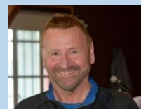
Steve Physical Fitness