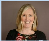
Dawn Social Services