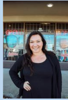
Sam Sporting Goods