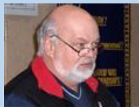
Jim Fish Hatchery