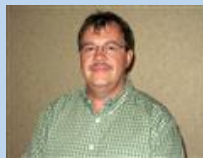
Greg Power Generation