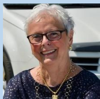
Susie Fine Arts Consultant