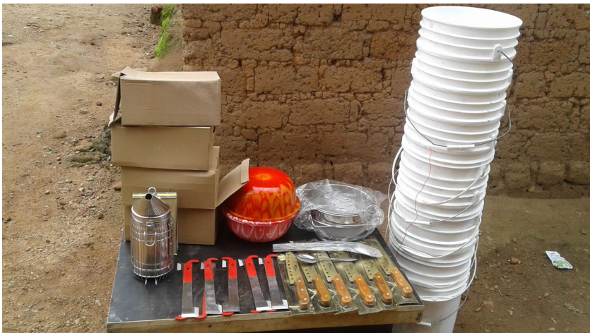
Jarbor-Jarkei Beekeepers Association of Kpagamai