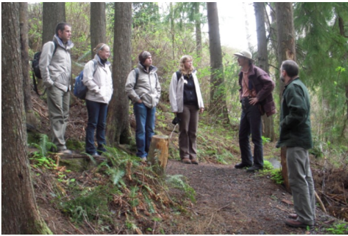
Aberdeen Rotary hosts an Australian Group Study Exchange learning forestry practices.