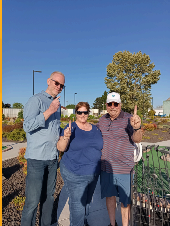
The Hole-in-one Club!