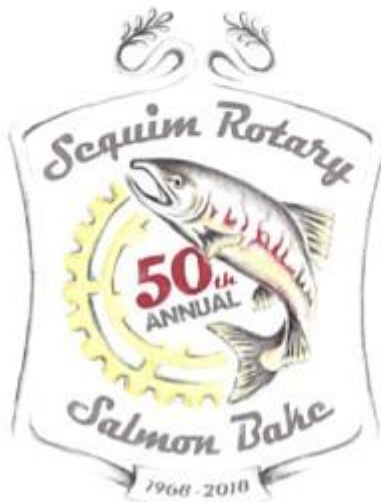
Artwork, Courtesy of "Stait Stamp Society"