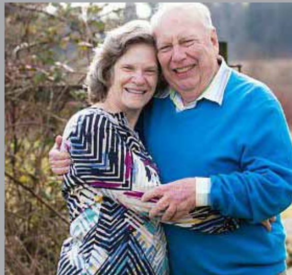
At the Meetings, cont'd p. 4

He will be most especially missed by his wife, children and grand-children, but also by us residents and Rotarians of Sumner.