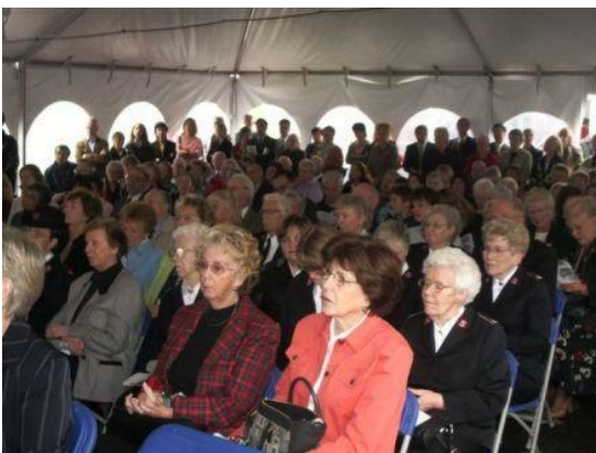
Over 150 people attended the official opening