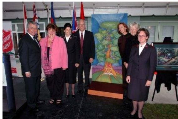
In front of the Tree of Life