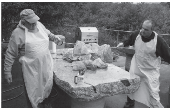
Above: Loading up the spit. Below: The AM Screwer's!