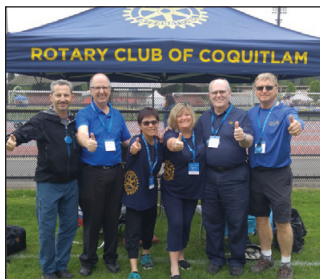
Our team at Relay for Life

Our members are business and professional people who are guided by the Rotary motto: "Service above Self". Our programs, locally or internationally, are focused on taking action by promoting peace, fighting disease, providing clean water, sanitation, and hygiene, helping families and children, supporting education and growing local economies.