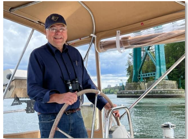
Cruising Burrard Inlet