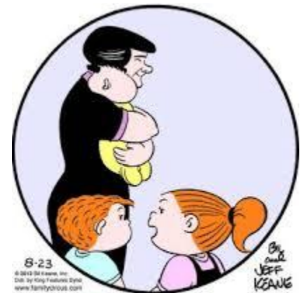
"Grandmas are good at hugging because they've had years and years of practice."